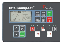
ComAp IntelliCompact NT SPtM